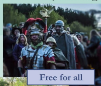
Free for all

On Saturday 25th May , there will be an open day (11:00-16:00) at Bourne Hall , where anyone can come along and have a try at digging, sieving or helping to process the finds. The day will include activities with Roman legionaries, as well as finds from previous digs, so do come along and see what's going on!