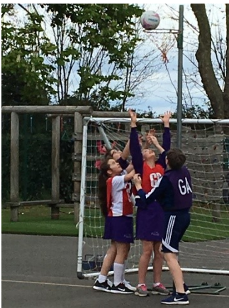
Warming up on Wednesday

Thank you too to all of the parents and grandparents who provided amazing support no matter where we were or what the weather was doing. We really appreciated the cheers from the sidelines!