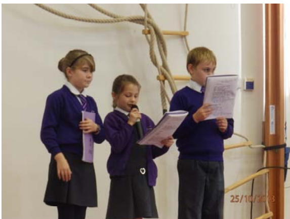
Children reciting their work.