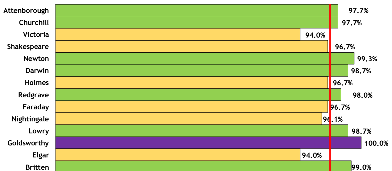
Attendance for Monday 19th - Friday 23rd June

Sparky says “well done!” to Goldsworthy Class , who had the best attendance this week with 100% , and to Britten, Goldsworthy, Lowry, Redgrave, Darwin, Newton, Churchill and Attenborough Classes , who also had high attendance this week!