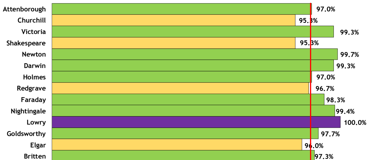
Attendance for Monday 10th - Friday 14th July

Sparky says "well done!" to Lowry Class , who had the best attendance this week with 100% , and to Britten, Goldsworthy, Faraday, Nightingale, Holmes, Darwin, Newton, Victoria and Attenborough Classes , who also had high attendance this week!