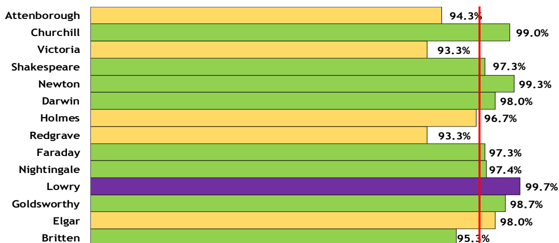
Attendance for Monday 17th - Friday 21st July

Sparky says "well done!" to Lowry Class , who had the best attendance this week with 99.7% , and to Britten, Goldsworthy, Faraday, Nightingale, Darwin, Newton, Shakespeare and Churchill Classes , who also had high attendance this week!