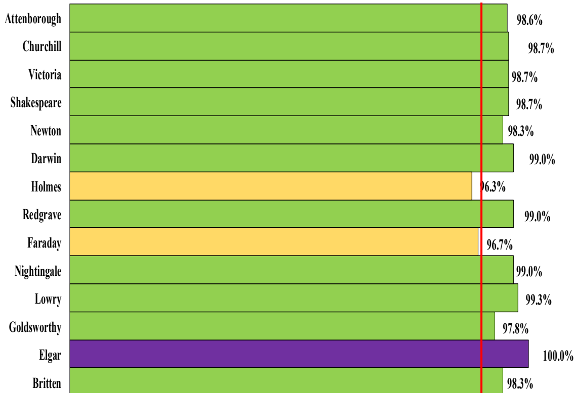
Attendance for Monday 30th April - Friday 4th May

Sparky says “well done!” to Elgar Class , who had the best attendance this week with 98.3% , and to Britten, Elgar, Goldsworthy, Lowry, Nightingale, Redgrave, Darwin, Newton, Shakespeare, Victoria, Churchill and Attenborough Classes , who also had high attendance this