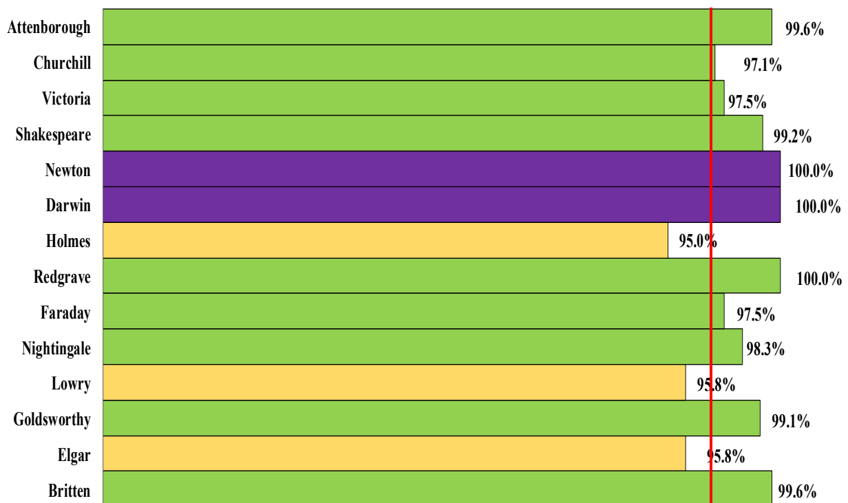
Attendance for Tuesday 8th - Friday 11th May

Sparky says “well done!” to Darwin and Newton Classes , who had the best attendance this week with 100% , and to Britten, Goldsworthy, Faraday, Nightingale, Redgrave, Shakespeare, Victoria, Churchill and Attenborough Classes , who also had high attendance this week!