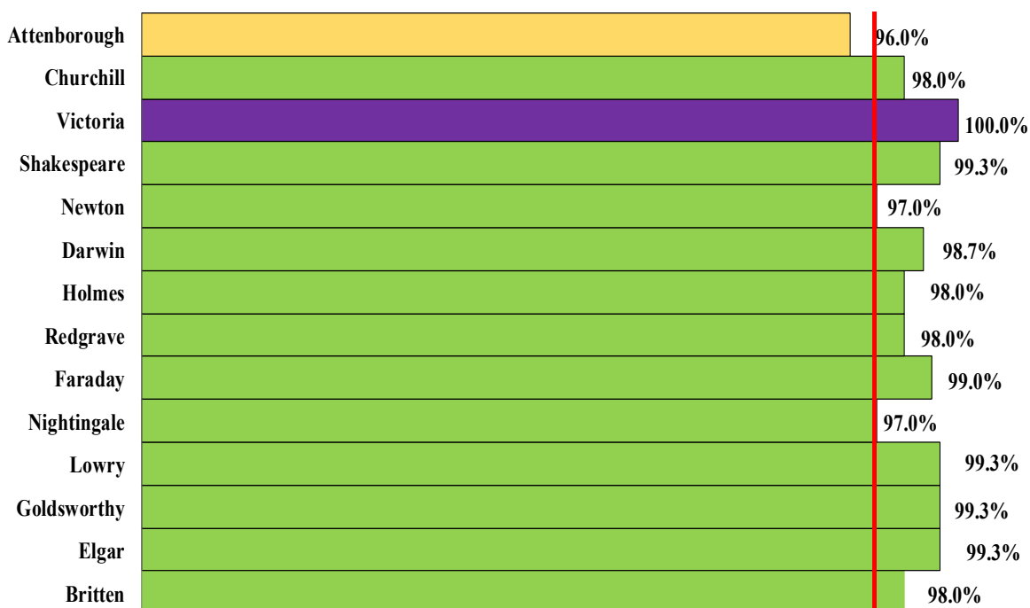
Attendance Monday 16th - Friday 20th September 2019

Sparky says "well done!" to Victoria Class , who had the best attendance this week with 100% , and to Britten, Elgar, Goldsworthy, Lowry, Faraday, Nightingale, Redgrave, Holmes, Darwin, Newton, Shakespeare, Victoria and Churchill Classes , who also had high attendance this week!