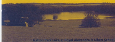
Gatton Park Lake at Royal Alexandra & Albert School