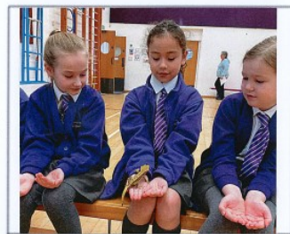
This is a child holding a geko.